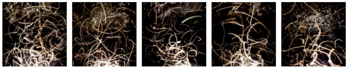
Light Writing 2014

Where to Purchase: Panopticon Gallery (Boston, MA), Wall Space Gallery (Santa Barbara, CA), Kehler Liddell Gallery (New Haven, CT), The Flatfile at Artspace (New Haven, CT).